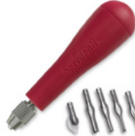
LCS ..... $19.00 Lino Cutter Set - Includes 5 blades, easily stored in the hollow handle.