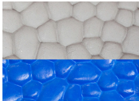
Medium Plastic Mats PA01-2 thru PA01-8 8" x 12" • $16.00

• • • See them all at georgies.com/mats • • •