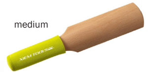
Xiem Clay Paddle 11.25" x 2.5" x .75" XCPL ..... $13.95