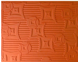
Flexible Rubber Mats TM100 - TM143 7" x 9" • $26.00