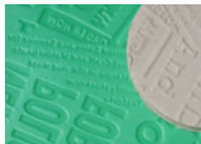
Large Plastic Mats PA212 - PA219 10" x 15" • $18.00

• • • See them all at georgies.com/mats • • •