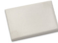
MC121 ..... 2" x 3" ..... $2.00 Blank unmounted linoleum pad